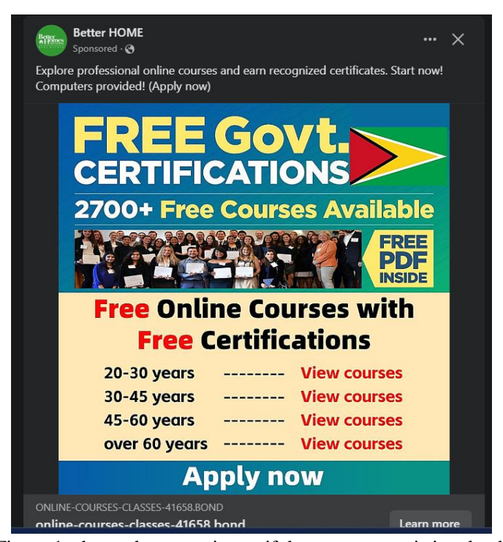
Figure 1: shows the campaign as if the government is involved.

It is important to note that this scam not only targets the University of Guyana but also presents itself as if the government is offering free courses to the public.